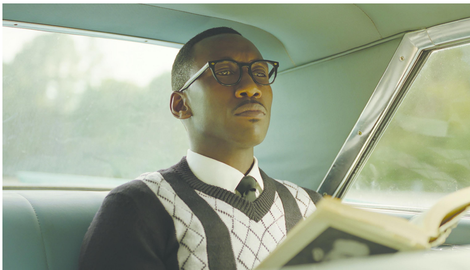
Mahershala Ali in "Green Book."

- Mark Rylance — Dunkirk : Because the film was still considered a Best Picture frontrunner at this time last year, it made sense that Rylance could be pulled along, but despite eight nominations for the film, including Best