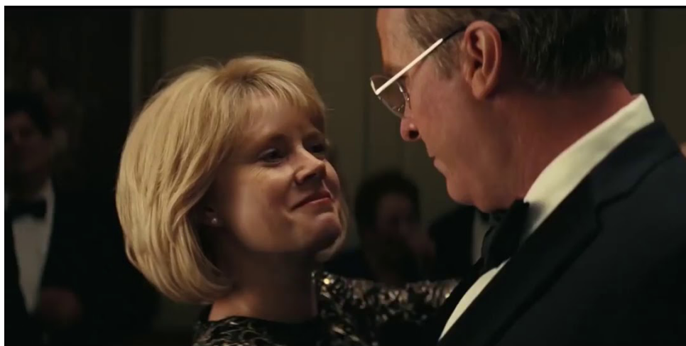
Amy Adams in "Vice."

- Laurie Metcalf — Lady Bird : She was nominated but unable to take down Allison Janney who kept winning on the precursor circuit