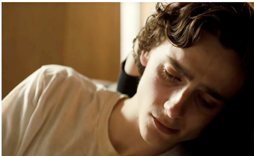
Timothée Chalamet in "Beautiful Boy."

Last year we saw three films vie for Best Picture that comment on the Trump regime: Dunkirk , Darkest Hour , and the eventual winner, The Shape of Water . This year, that trend continues. For this reason, it comes as no surprise that most of this year's Best Supporting Actor contenders come from films that capture the zeitgeist. First up is Green Book , which recounts the true story of a New York bouncer (Viggo Mortensen) who drove a Jamaican-American classical pianist (Ali) on a tour through the 1960s' American South. Although billed as a comedy, much of the South was steeped in racism back then, and without spoiling the film, much of what unfolds is far from laughable—though the director, Peter Farrelly handles the subject matter with kid gloves, thereby avoiding that it becomes the film's focus, much the way it was handled in 1990's Best Picture winner, Driving Miss Daisy . The film, which has seven BFCA nomi-