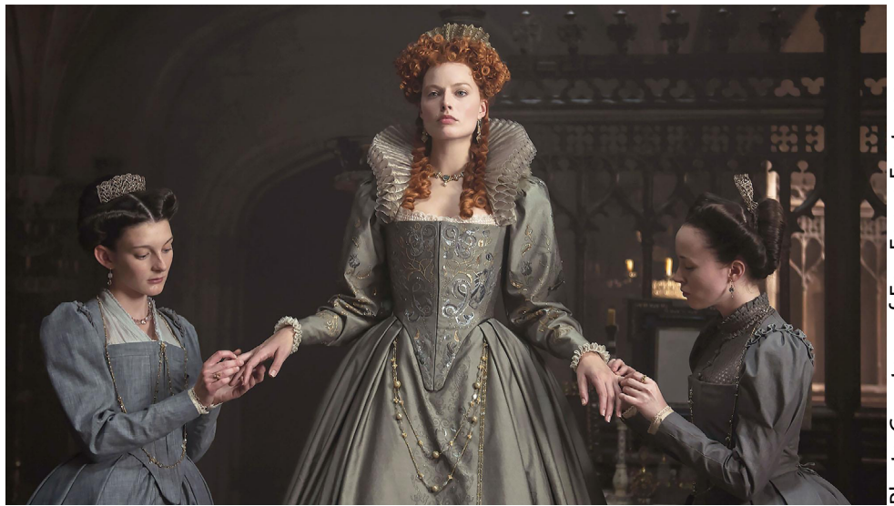
Margot Robbie in "Mary Queen of Scots."

Although British actress Foy is new to the Oscar conversation, she is well known for her role in the Netflix drama The Crown , which netted her a Golden Globe win for Best