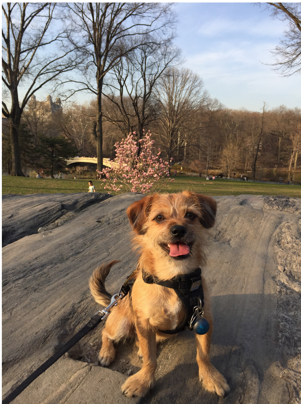
POOJA VISWANATHAN | NATURAL SELECTIONS

WG: What's a weekend? My activities are eat, sleep, poop, and play. My favorite is play.