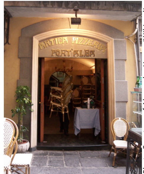
Pizzeria Port Alba in Naples

Other cities are known for their own unique style of pizza. Perhaps the most famous is Chicago, known for its deep dish pizza. The format, started by Pizzeria Uno, has high edges and uses chunky tomato sauce. In California, pizza is usually a personal sized pie that is topped with local vegetables and avocado. In St. Louis, the crust is made with a yeast-free dough and topped with processed