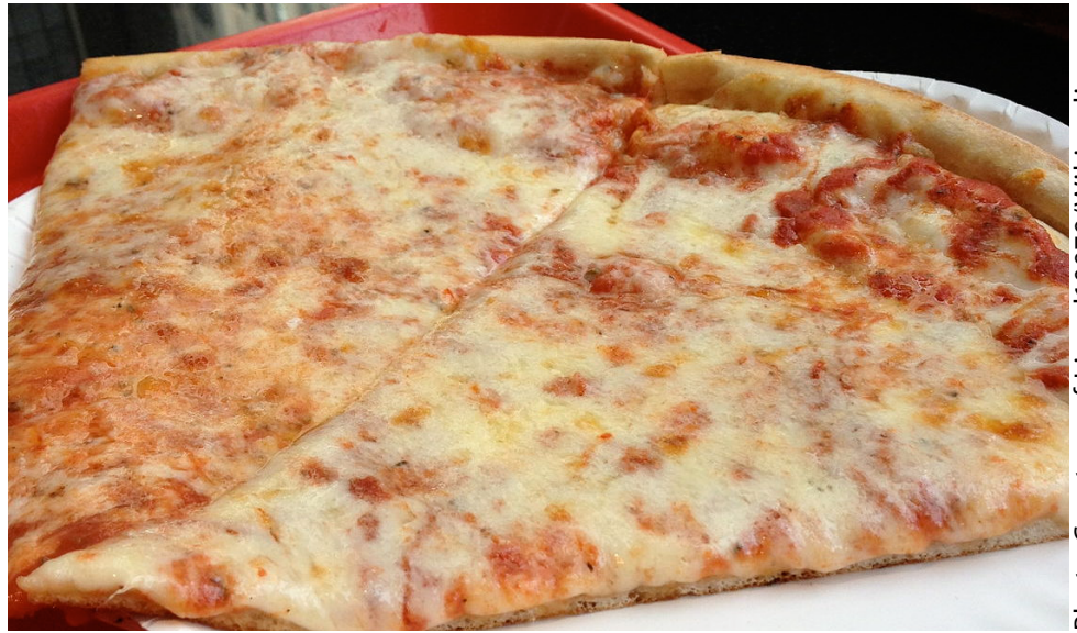
Slices of New York-style pizza.

Pizza first appeared in the U.S. in the 1800s, mostly among Italian immigrants. It surged in popularity after World War II, as many soldiers who had been stationed in Italy came home and raved about pizza. There is some contention as to which was the first pizzeria in the U.S. In 1897, Gennaro Lombardi opened a grocery store on Spring Street here in New York City that evolved into a pizzeria, receiving a city-