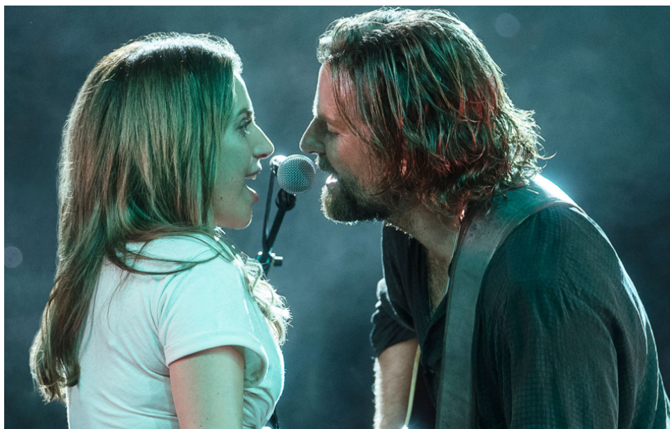
Lady Gaga in "A Star is Born."

This is the fourth time the film has made it to the silver screen. The first, in 1937 starred Janet Gaynor and Fredric March, both of whom earned Oscar nominations (six Oscar nominations and two wins, including an Honorary Oscar for W. Howard Greene's color photography, Metacritic Score: 77). The second, in 1954, starred Judy Garland and James Mason who were also nominated for their roles in this musical version of the classic (six Oscar nominations, Metacritic Score: 89). The last version, in 1976, starred Barbara Streisand and Kris Kristofferson, neither of whom were nominated for acting (three Oscar nominations and one win for Streisand for Best Music, Original Song, Metacritic Score: 58). Forgive the pun, but critics from Venice to the Toronto International Film Festival (TIFF) have been going gaga over the latest version, and Gaga's performance in particular. She has been nominated for Best Achievement in Mu-