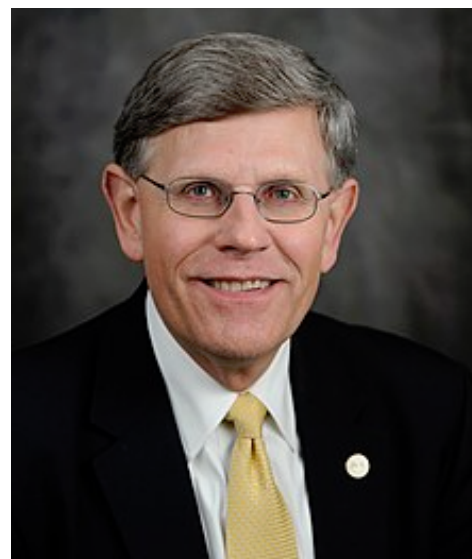
Kelvin Droegemeier, November 19, 2014.

Reactions to his nomination by his peers have been positive. John Holdren, Ph.D., a previous director of the Office of Science and Technology Policy, called Droegemeier "a solid choice." He said that Droegemeier was a