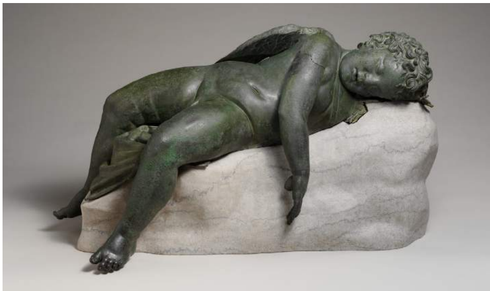
Greek statue entitled 'Eros (Cupid) Sleeping' from the 3rd-2nd century B.C.

To answer this question, we can look to another common Valentine's Day symbol that stems from Greek and Roman mythology: the God of love, Cupid. Usually portrayed as a young and winged boy, Cupid is armed with a bow and arrow; anyone who is struck by one of his arrows, mortal or not, is overcome by af-