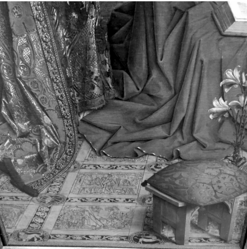
BERNIE LANGS/Natural Selections

The imagined church setting makes the angel's presence even more troubling. As I looked harder, deeper into the pictorial space, the angel's robe seemed to flow out from the two-dimensional surface and the embroidery and jewels appeared to be impossibly rendered in its exacting detail. How could anyone see such detail and walk around with it on a daily basis? I felt that