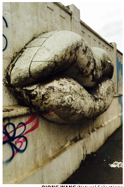
QIONG WANG/Natural Selections