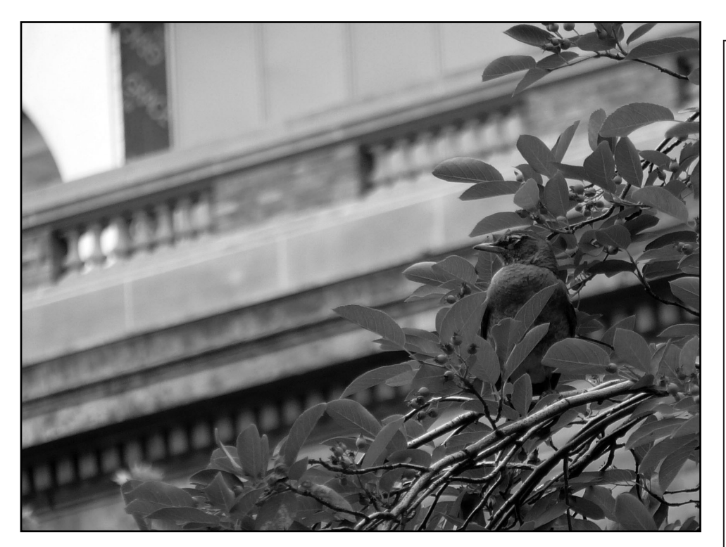
A robin enjoys some berries outside of Smith Hall.