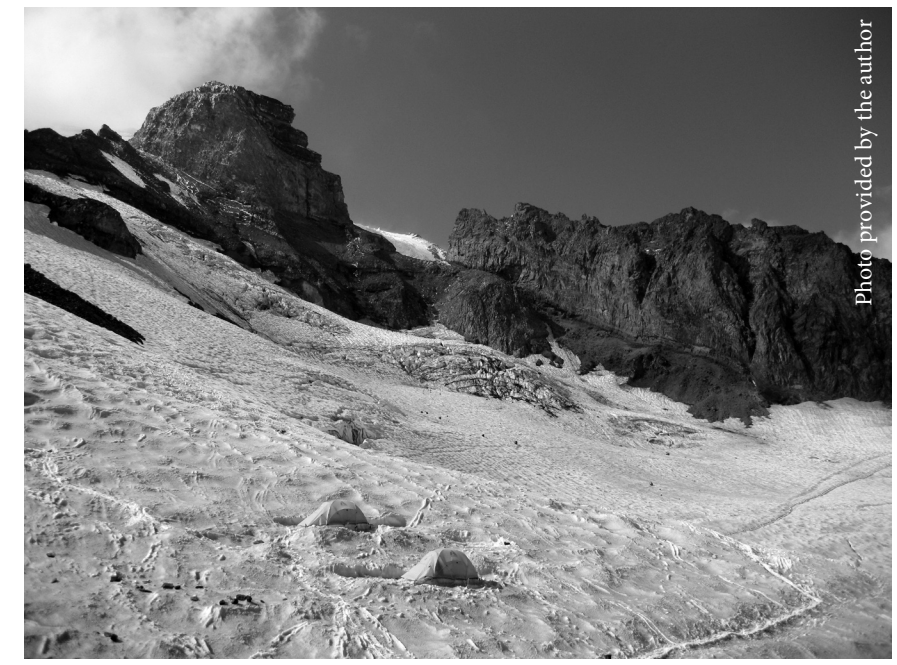
View towards the upper mountain from Camp Muir and zigzagging trail visible on the far right. .

At precisely 1 A.M., eighteen climbers and six guides (the entire RMI contingent on the mountain) set out across the Ingraham glacier. Rest stops on a climb of this type are dictated not by the obvious exhaustion of the climbers, but rather by the location of objective climbing hazards such as rock fall and icefall. This is precisely the reason that climbers attempting the summit of Rainier generally leave Camp Muir at or around 1 a.m.so as to avoid the very soft snow conditions which let loose rock and ice during the heat of midday. As we snaked our way up the mountain all I could see in front of me were meandering lines of headlamps scattered on the route above. By the second rest break, above a particularly difficult section of the route known as Disappointment Cleaver (a cleaver is a rocky outcropping that signifies the divide between two glaciers), I was becoming increasingly cold–even