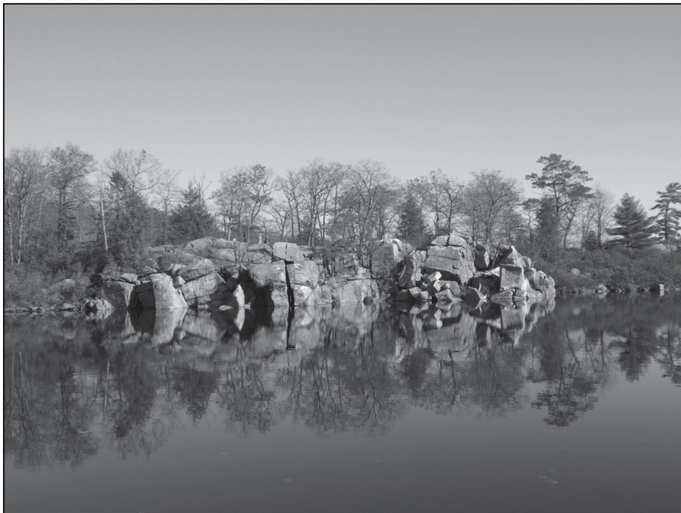
Mirror by Elodie Pauwels