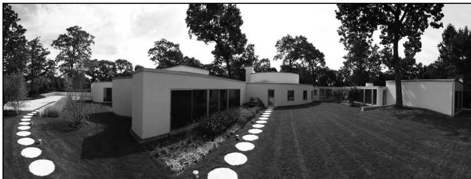
The Wallace K. Harrison Estate, newly restored in 2009.

For years, every morning on my way to work, as I hurried along the white marble pathway leading from the driveway to the buildings on the North end of The Rockefeller University's campus, I stared uncomprehendingly at the exterior of the long, low building, formally known as Abby Aldrich Rockefeller Hall. What an eyesore, I would think as I passed. I knew I should be more open-minded, but I just didn't get it, and I couldn't help but wonder about the person who designed it—a person with aesthetic taste so strikingly different from my own that he could consider something like this beautiful. Who was this guy? One day I finally decided to look him up.