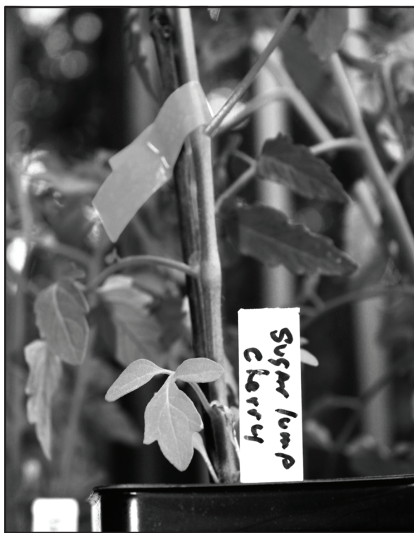
Cherry tomatoes.

ers. Now that I have sung the praises of a CSA, I think that it is only fair to inform you of the potentially negative aspects surrounding the business model, especially the idea of shared risk. One cannot possibly predict natural catastrophes such as floods or, as was the case for tomatoes in 2009, a fungal blight. If something happens that compromises your ability to receive your share (from the farmers’ end), you cannot get a refund. Additionally, some crops can do much better than others, so it is possible that you get a disproportionately high amount of, say, beets and very few cucumbers. In spite of this, I still strongly believe that the benefits outweigh the risks and, therefore, I will always buy local (which is almost always equivalent with being the most fresh) and support my CSA whenever possible. I urge you to do the same.