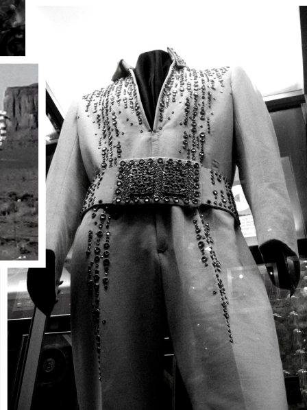
One of Elvis's many glittering jumpsuits on display at Graceland in Memphis, TN.

Day 7 —Going through Texas, Oklahoma, and Arkansas we pass through familiar interstate-close towns homogenized by Starbucks, Wal-Mart, and the like. We reach Memphis, Tennessee. Gleefully, we head for Graceland, an attraction infamous for its tackiness. On the off chance you don't know, Graceland was Elvis Presley's home from 1957 to his death in 1977. We tour the house, luxuriously decorated in high-seventies kitsch: shag carpeted ceilings, waterfalls, velvet upholstery, mirrored ceilings. Elvis's planes rest in a faux airport complete with boarding gate and "Elvis Fan Detector." The "airport" is a site of perfect