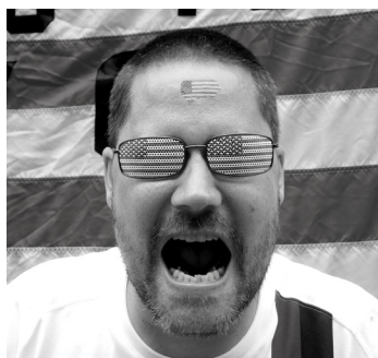
An enthusiastic US supporter before the USA v. Ghana match

Next up, it was USA v. Italy at the Fritz Walter Stadium in Kaiserslautern where the atmosphere was electric. K-town, as Kaiserslautern is known to US military personnel, and its surroundings are populated by more than 30,000