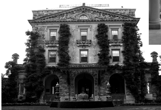
The villa at Kykuit

A visit to the estate also includes a tour of the coach barn, which houses a collection of classic automobiles and horse-drawn carriages. A warm spring or summer day is most suited for visiting the Rockefeller Estate, as it can get windy during the garden viewing. Tours start at Philipsburg