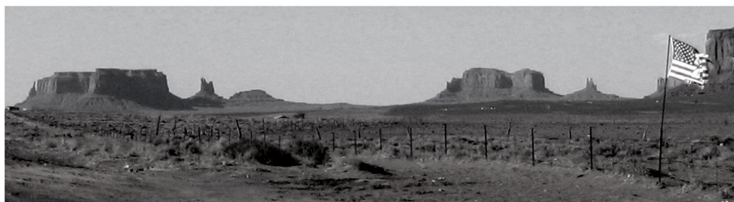
The red buttes of Monument Valley are featured in many films including The Searchers , The Eiger Sanction , and Indiana Jones and the Last Crusade .