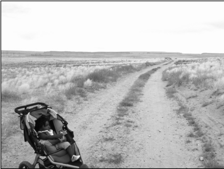
Miralena admires the vastness of the high desert.

Within half a mile of home I am running along a wash-boarded dirt road, bumping over rocks and jumping over holes in the ground the size of manholes in Manhattan. The road is lined with the skeletons of small animals and the remnants of fires set by locals hiding in the desert while they drink. There are no trees or there is nothing taller than I (except for the odd cottonwood that stands alone in a field), and the big, clear blue sky offers no protection from the relentless sun looming overhead like a bare bulb in a closed room. The good news is that the humidity is so low that even on the hottest day in August, when the air temperature gets up to 95 °F, I barely break a sweat. Still, dehydration comes easy in the desert and I find myself drinking more than I ever did in New York.