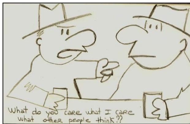
Cartoon by the author

From the moment someone acts on his or her opinions, whether by committing to a cause, exhibiting art, or publishing a work, for example, he or she is prone to be criticized. As a scientist, I am aware of critics—but not always prepared to respond to them. Critics