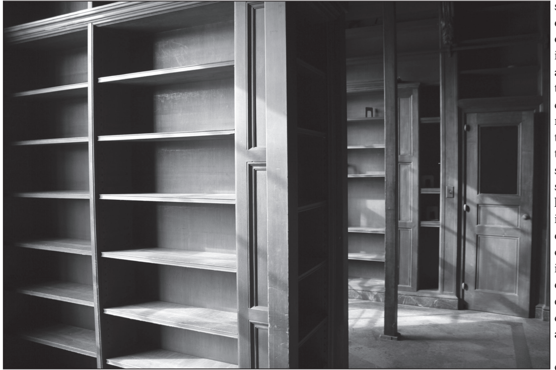
Bookshelves and old telephone booth. 2nd Floor, Welch Hall. December 2010.

During last month's issue, as we lamented the passing of Otis, the obsolete but charming elevator in Welch Hall, the library staff was hard at work packing up the collections and moving to the 17th floor of Weiss, while work crews were gearing up to begin the long-postponed renovation. Around that time, I had the opportunity to photograph Welch Hall empty, wandering through its various reading rooms, vaults, and former kitchens (more on those later). And while snapping photos of empty bookshelves and offices, I was reminded by the old and often inscribed adage that "the library is the heart of the university." One might wonder that with the university library under renovation, could it be that the heart is on life support?