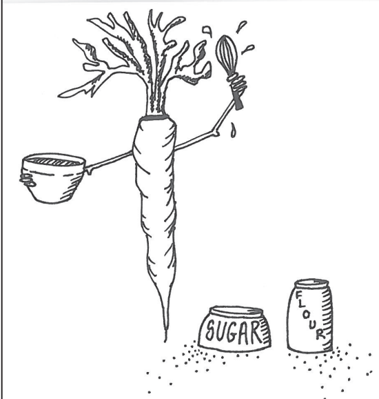
Cartoon by the author

thought she wasn't up to the trip, and I hadn't wanted her to know what she was missing.