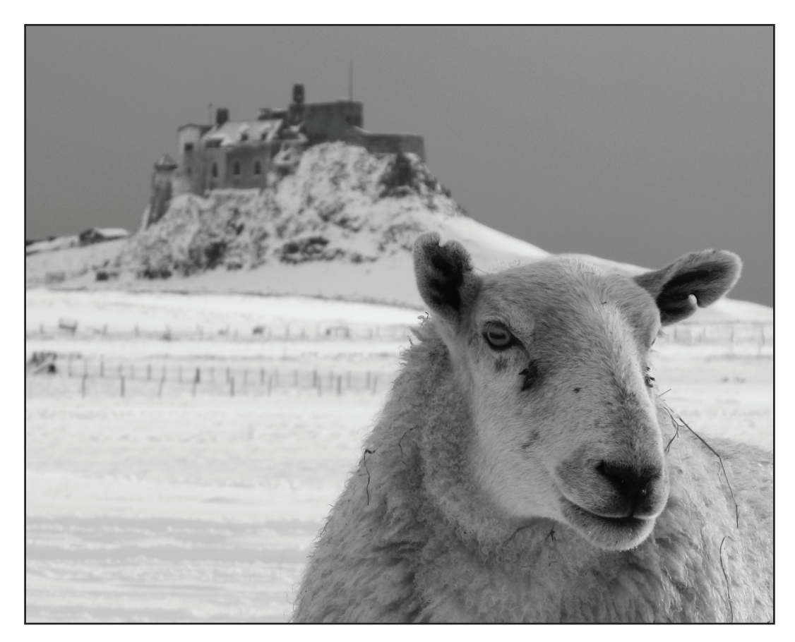
Winter on Lindisfarne Island