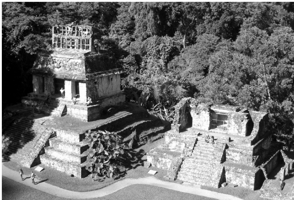
Mayan temples in Palénque

Aztec people came from Tula, the capital of the legendary Toltec civilization. The Toltec people, in turn, migrated from Teotihuacán, the place where gods were born. The remains of Teotihuacán are located about one hour's drive away from Mexico City. Although the excavation there is not completed yet, what we saw easily took our breath away. Several huge pyramidal temples, all with Teotihuacán's characteristic slope-panel style, line the Avenue of Death, the main arterial road of the city. Teotihuacán was the first