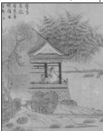
Above: Qian Xuan, Chinese, ca. 1235–before 1307. Wang Xizhi Watching Geese. China, Yuan dynasty (1271–1368), ca. 1295. Handscroll; ink, color, and gold on paper. Below: Yuan Jiang, active ca.1680–ca.1730. The Palace of Nine Perfections, China, Qing dynasty (1644–1911), dated 1691. Set of twelve hanging scrolls; ink and color on silk.

Many years ago, I attended a lecture by then Director Philippe de Montebello; he explained that the longer one looks at a work of art, the more one sees. He implored the audience to take their time with a painting, to let its meaning seep in. He said that he was once at The Frick Collection, where he stood for so long in front of a Velasquez painting that a security guard came over to check on him. Please visit “Chinese Gardens” and stand for a while in front of these fabulous works of art, which offer the viewer so much. ☺