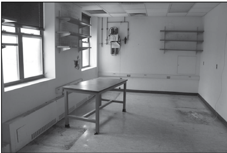
3rd floor Flexner Hall, August 2010