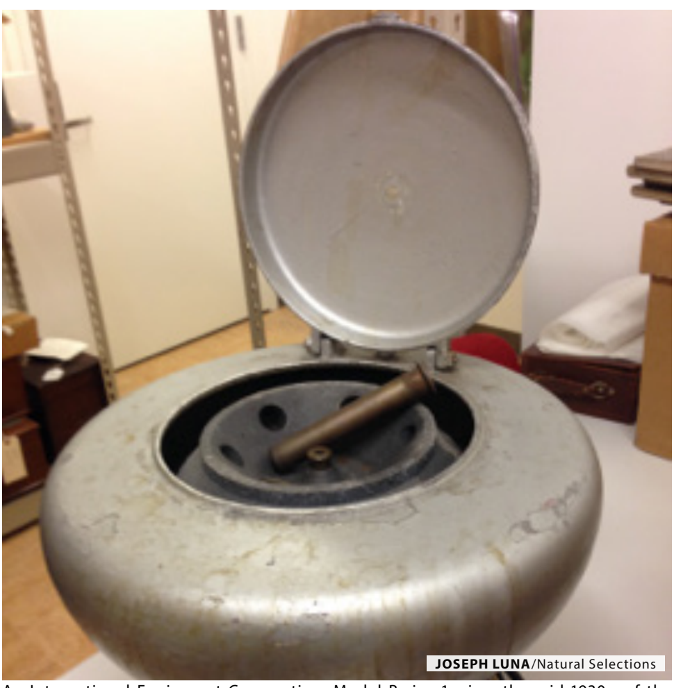
An International Equipment Corporation, Model B size 1, circa the mid-1930s, of the type used by Claude for cell fractionation. RU historic instrument collection, accession number 342.

It was then that Claude turned his atten-