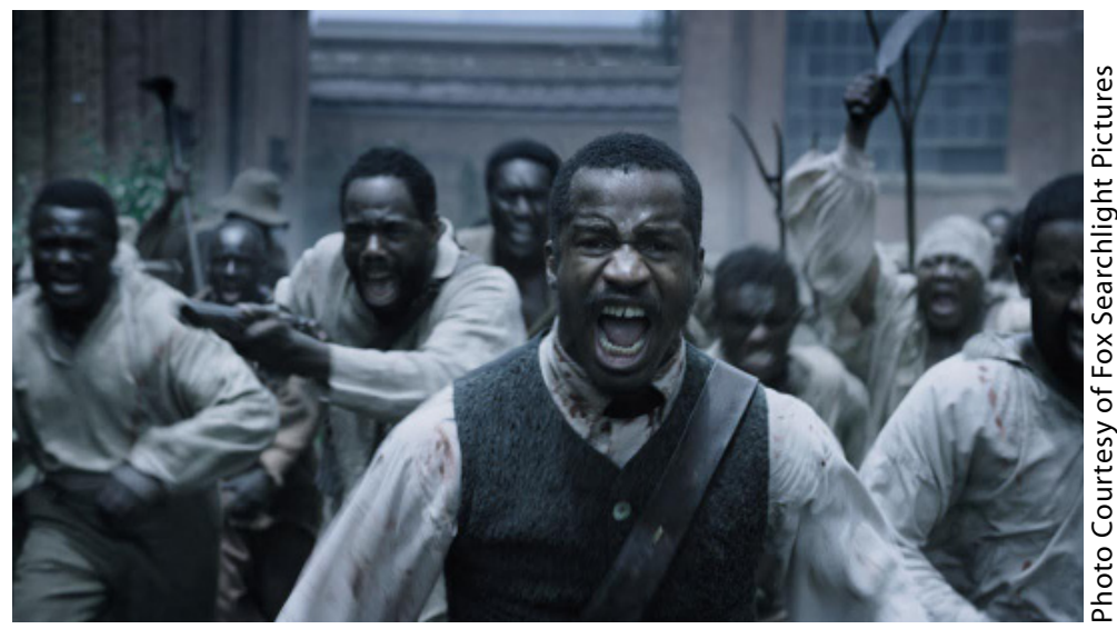
The Birth of a Nation