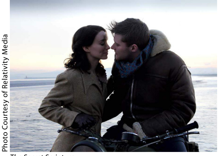
The Secret Scripture

FYC returns in July-August when we'll have much more to discuss, after Cannes has shown its cards, and we launch into our annual One's to Watch three-part series.