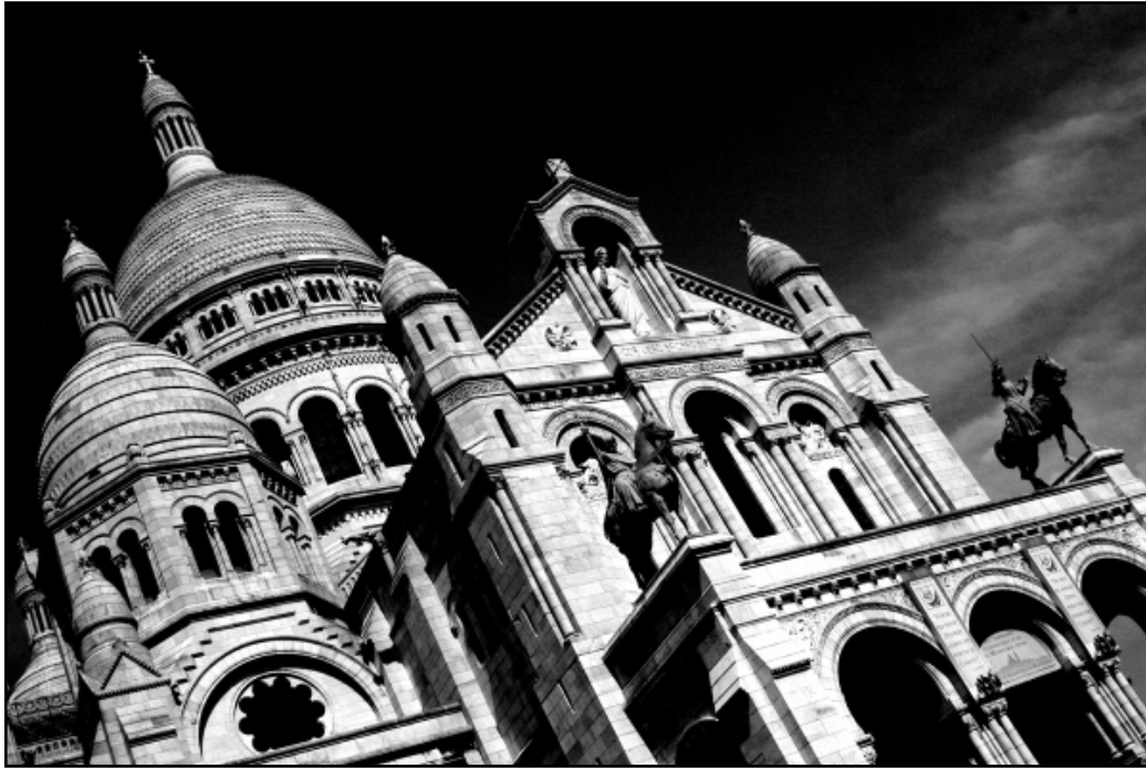
The Basilica of Sacré-Coeur