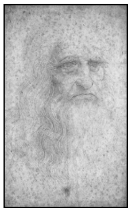
Superhero Leonardo da Vinci's late self-portrait

Having seen the previews, I decided to watch the first episode of the British-exported television series Da Vinci's Demons with the idea in mind of writing a scathing review of the show for its comic book depiction of one of the world's greatest geniuses, Leonardo da Vinci (1452-1519), hero of the Italian Renaissance. As I viewed the show, I became surprisingly engaged and found myself tuning in a week later for the second episode, which, though weaker than the premiere, held my interest enough for me to want to watch future episodes. That's not to say the show isn't ridiculous, cartoonish, and nothing like the times or the man it features. I currently don't watch any television weekly series, so it's quite a shock that I'm engaged with this one.