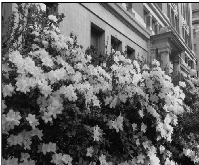
Stop to admire the azaleas, but don't take a bite!

Hydrangeas are another mildly toxic, yet beautiful flower found on campus. This plant produces a large pompom of white or blue flowers, with the coloring dependent on the acidity of the soil. The boastful bloom is often seen as a symbol of abundance, devotion, and enlightenment. I especially enjoy spotting hydrangea because they were a favorite element in my great grandmother's garden. Whenever I see one, I am transported back to the time I spent with her. In light of my feelings towards the hydrangea, I realize that some of my fondness for plants is due to a learned experience within my lifetime; however, I do not doubt the deeper evolutionary response. But why are we aesthetically attracted to a toxic flower? Because it is pretty and we know better than to eat it. We know it is important to stop and smell the lilacs, or whatever flower we may be passing, to slow down from our hectic lives and enjoy the simple wonder of our complicated world. ☉