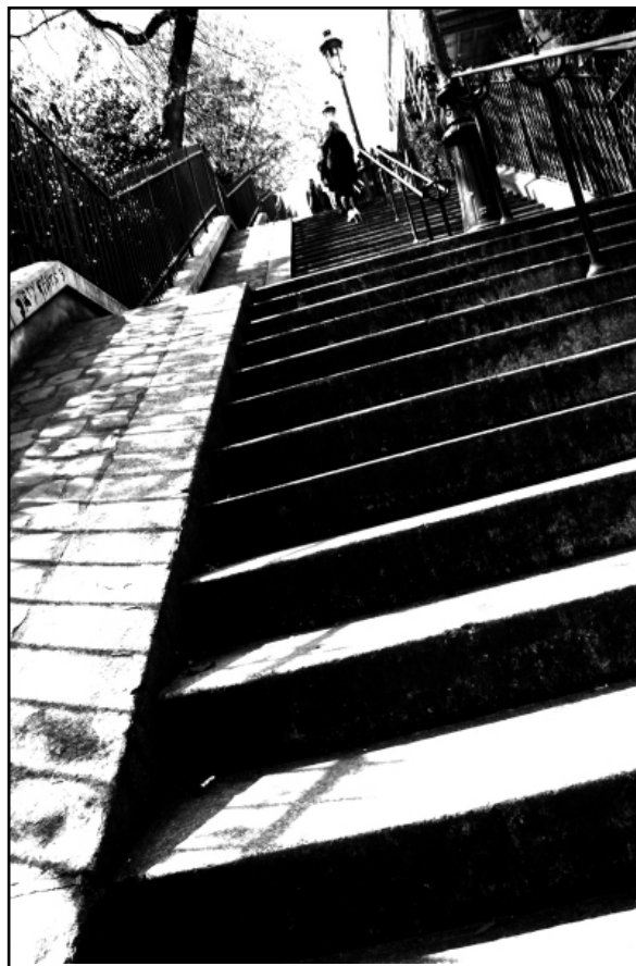
Stairs in Montmartre